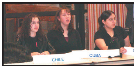
Eugene IHS students attend the "Model United Nations" simulation