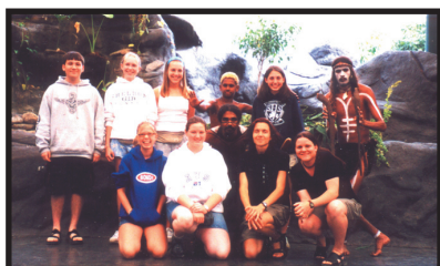
Eugene IHS students visit Cairns, Australia

Established in 1984, Eugene International High School (Eugene IHS) is an alternative school in international studies for grades nine through twelve. The school is designed for students who value global understanding and communication, cultural differences, and improving the human condition. Eugene IHS is a four-year interdisciplinary curriculum focused on the study of nations, their cultures, history, artistic expression, and political, economic, and belief systems. Students who graduate from Eugene IHS will have developed a cultural awareness necessary for international communication and understanding.