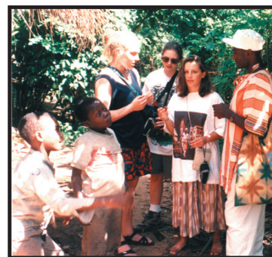
A delegation of Eugene IHS students attended an International Baccalaureate Conference in Tanzania, Africa

Eugene IHS is a member of the International Baccalaureate Program, a world wide affiliation of schools that promotes international standards of achievement. All the course work for Eugene IHS juniors and seniors meets the requirements for the IB. Eugene IHS students may choose to pursue the full IB diploma with examinations in six subjects or to earn certificates in specific areas of study. The IB diploma and the certificates can earn students college credit in universities and colleges all over the world. For more information on the IB diploma program go to the International Baccalaureate Organization's website at: www.ibo.org .