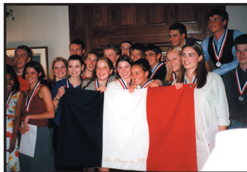
Eugene IHS offers French and Spanish immersion programs